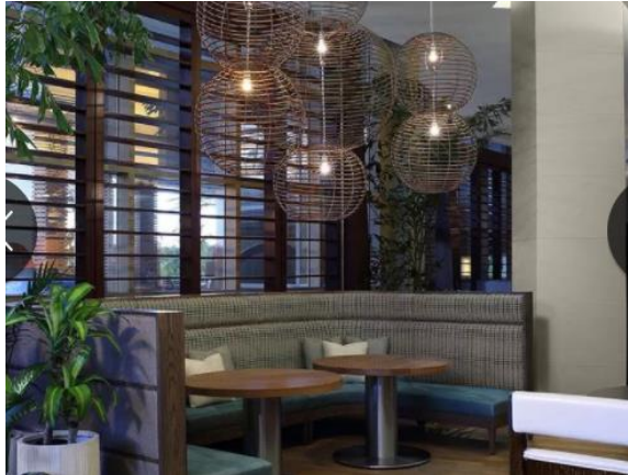
Mantra launched in 2017 at the Naples Grande Beach Resort in Naples. Naples Grande Beach Resort