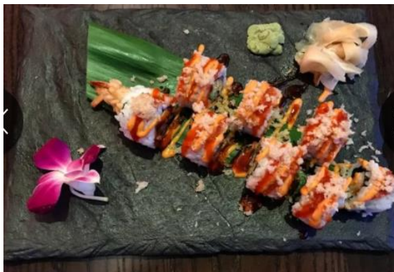
The dagwood roll ($18) at Mantra includes shrimp tempura and blackened tuna.