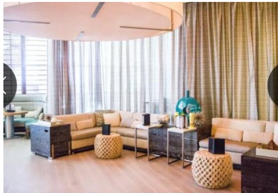
The Naples Grande reopens on Friday, Dec. 15, after repairs from Hurricane Irma damage was completed. Parts of the hotel are still under construction from water damage.