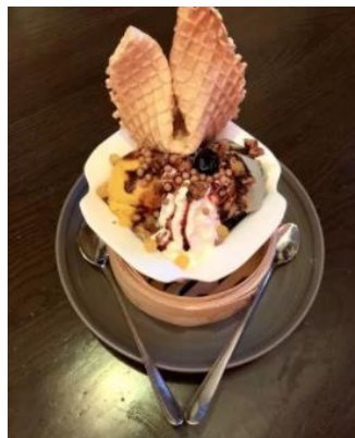
The Mt. Fuji Sundae ($14) includes green tea ice cream and mango sorbet garnished with a waffle fortune cookie, boba pearls, whipped cream and candied pecans.