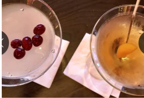
The white dragon cocktail ($14), left, and the samurai cocktail ($15) at Mantra.