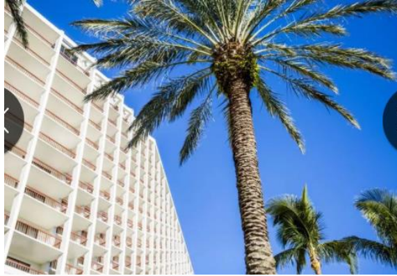
The Naples Grande reopens on Friday, Dec. 15, after repairs from Hurricane Irma damage was completed. Parts of the hotel are still under construction from water damage.