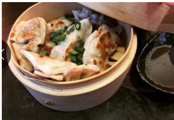
Chicken lemongrass dumplings ($13) include a chile sesame sauce at Mantra.