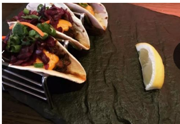
Korean barbecue beef tacos ($16) at Mantra.