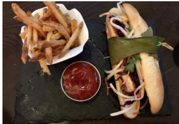
A banh mi sandwich ($19) with glazed salmon at Mantra.