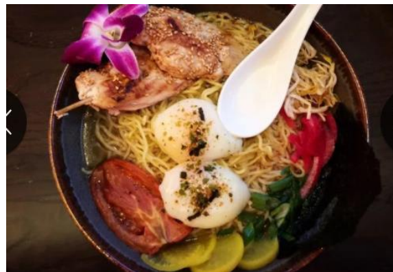
A built-your-own-bowl at Mantra, featuring miso ramen noodles with soy ginger chicken.