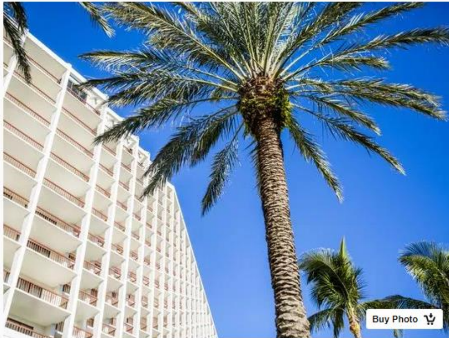
The Naples Grande reopens on Friday, Dec. 15, after repairs from Hurricane Irma damage was completed. Parts of the hotel are still under construction from water damage.

"We're starting back slow," Cavella said. "We've been closed for a long time. All the energy from the staff is what's exciting."